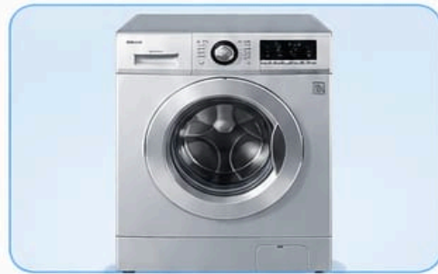
(ii) A Washing Machine