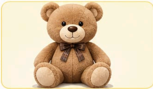
i) A Teddy Bear.