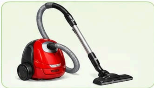
iii) A Smart Vacuum