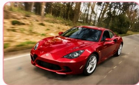
( iv ) A Car

Which one uses AI to clean room by itself?